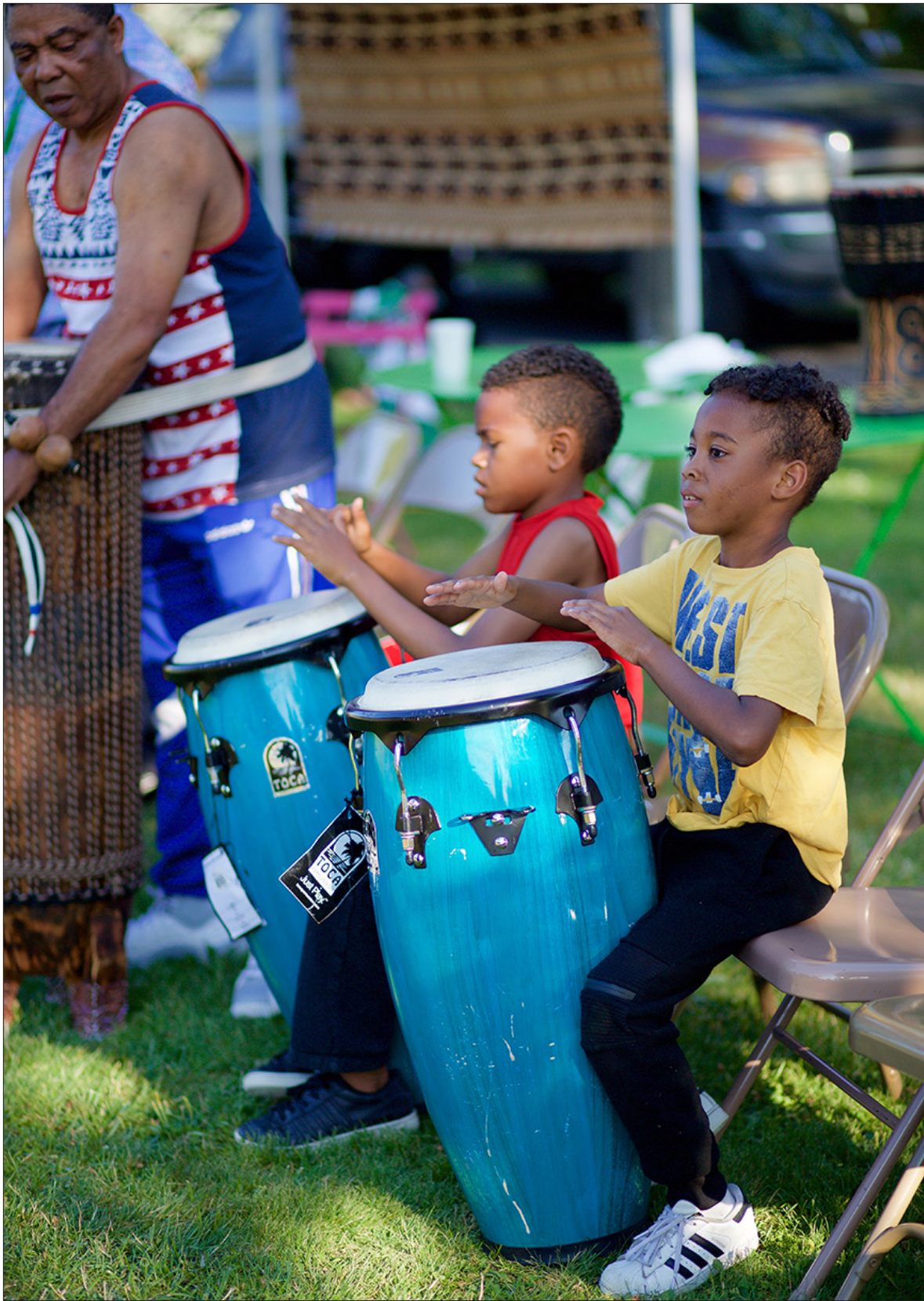
Drummers, African Village Experience funded through Seattle Office of Arts & Culture's Arts in Parks