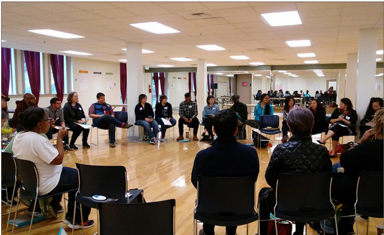
Building Art Space Equitably (BASE) cohort meeting

In the fall of 2017, with funding from the Doris Duke Charitable Foundation, we were able to expand the group of five to a racially diverse group of twelve and to hire a Project Manager/Facilitator to support us in reaching our goals. After a period of recruitment, we began meeting as a steering committee, remotely and in person, for conversations, racial justice trainings, and—at the heart of it—for support in operationalizing equity practices in the organizations where we work. As a “leave-behind” from our work together we created this RE-Tool for racial equity in the panel process.